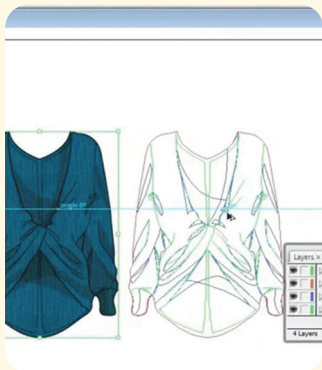
COMPUTER AIDED DESIGN