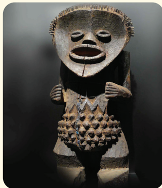
AFRICAN ART & CULTURE