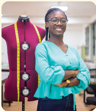
INTRODUCTION TO FASHION